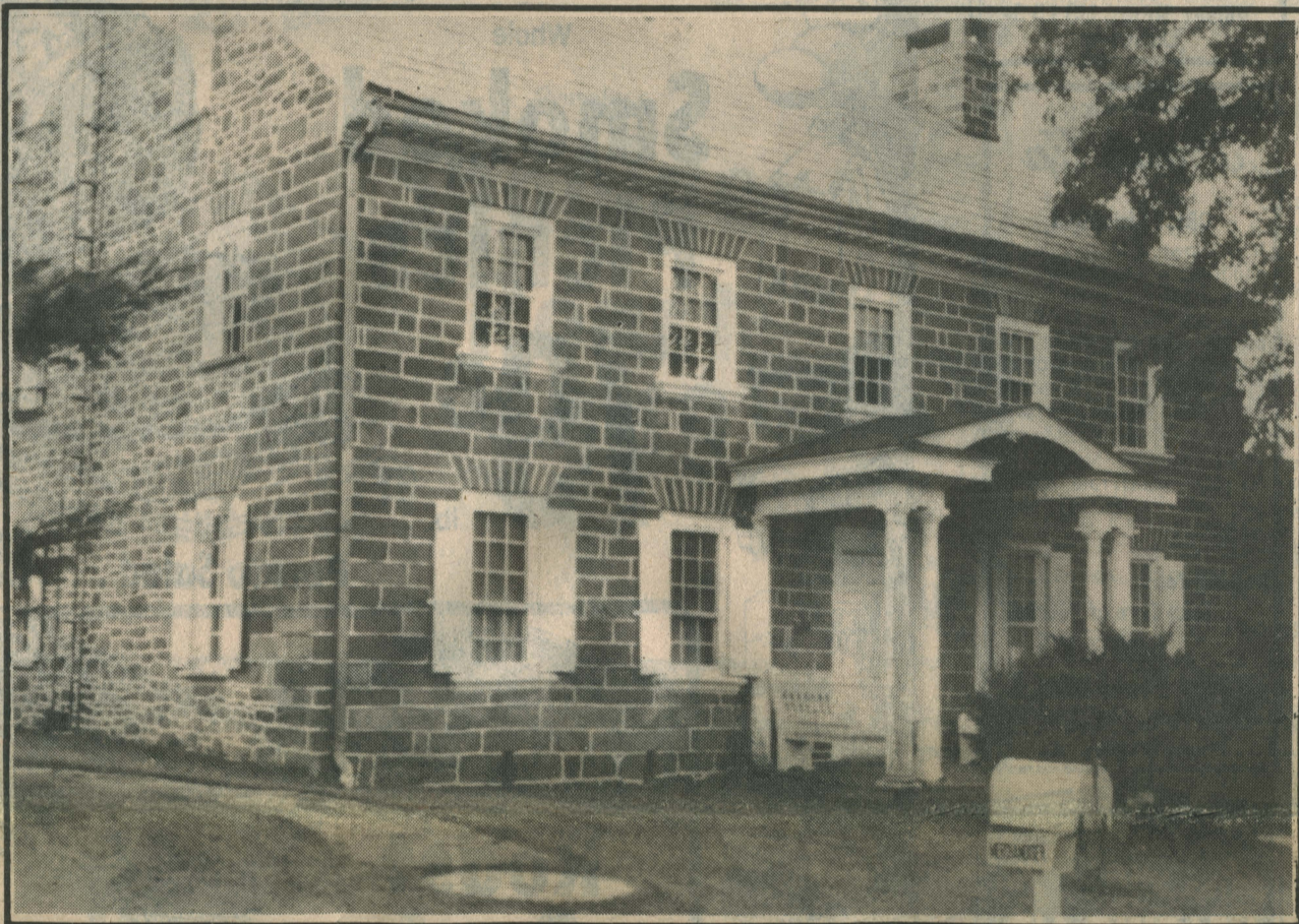
The red sandstone house built in 1786 by Isaac Deardorff.

Isaac was concerned with building a sturdy dwelling. His first home was a typical one-room cabin built of hewed logs. He then built a new house, completed in 1786, which was framed and finished with sawed lumber; no hewed beams typical of most eighteenth century houses were used. Since they were situated along a busy road, Isaac also used this eight room house as