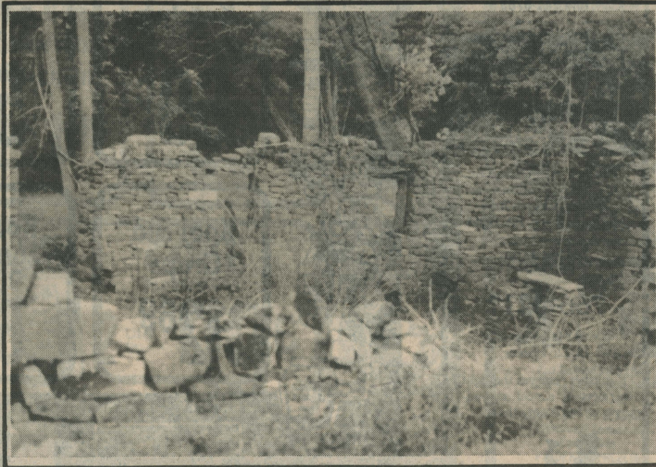
The foundation of the mill.